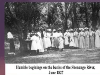
Humble beginnings on the banks of the Shenango River, June 1827