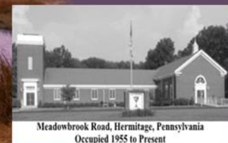
Meadowbrook Road, Hermitage, Pennsylvania Occupied 1955 to Present